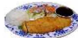
Pork Katsu Plate