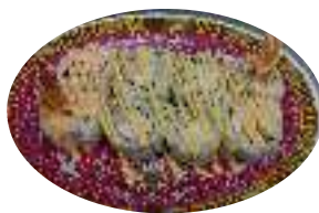
Shrimp & Krab Roll