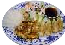
Chicken Teriyaki & Gyoza