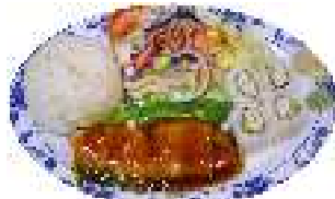
California Roll & Grilled Salmon