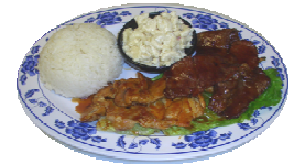
BBQ Chicken & Beef Plate