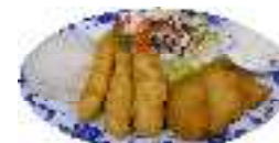
Fried Seafood Mix Plate