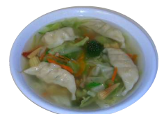
Gyoza & Vegetables Soup