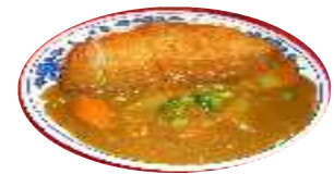
Chicken Katsu Curry