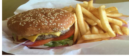
Cheese Burger Combo