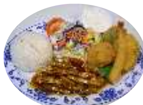
Chicken Teriyaki Fried Shrimp & Fried Vegetables