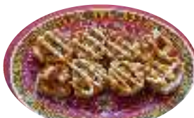
Tempura style Shrimp Roll