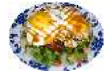
Junz Loco Moco