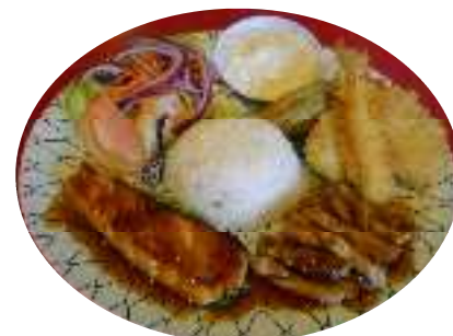
Chicken Teriyaki Grilled Salmon Fried Shrimp & Fried Vegetables