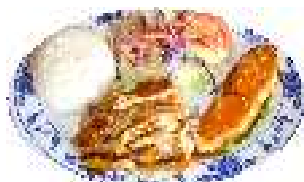
Chicken Teriyaki & Grilled Salmon