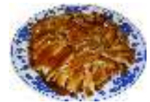
Chicken Teriyaki Bowl