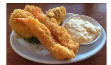
Fried Shrimp & Fried Vegetables