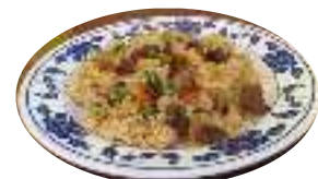
Mix Fried Rice