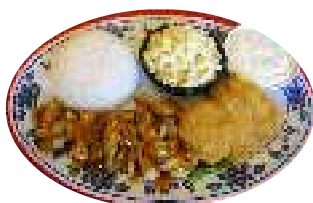
Chicken Teriyaki & Fried Fish