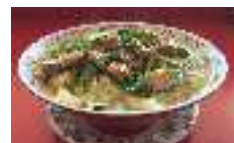
Chicken & Vegetables Saimin