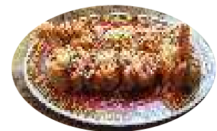
JUNZ Special Roll