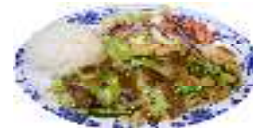
Beef & Vegetables Teriyaki Plate