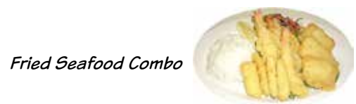
Fried Seafood Combo