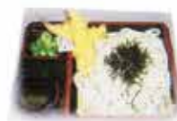
Ten Zaru Udon