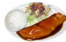
Grilled Salmon Teriyaki