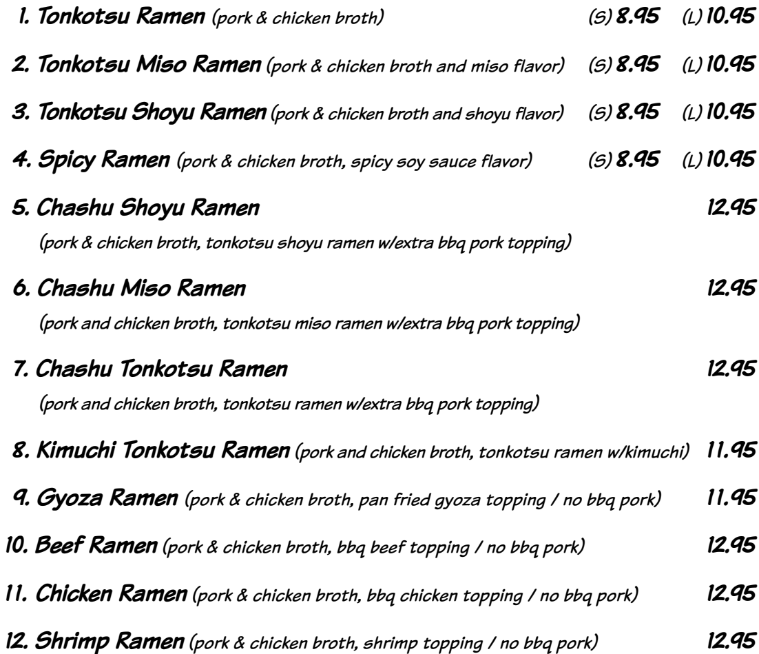
Chashu Miso Ramen