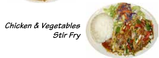
Chicken & Vegetables Stir Fry