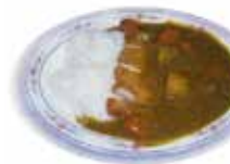
Katsu Curry Rice