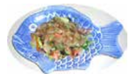
Salmon Skin Salad