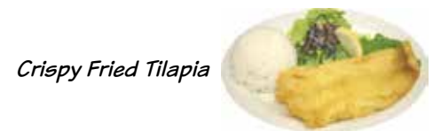
Crispy Fried Tilapia