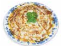
Chicken Teriyaki Don