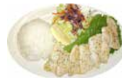
Grilled Orange Roughy