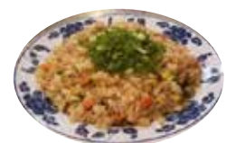
Chicken Fried Rice