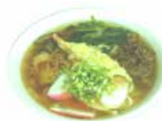
Hanaoka Special Udon