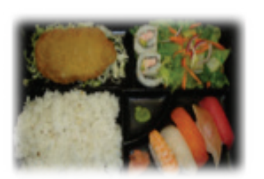
Tonkatsu and Sushi