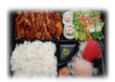
Sashimi and Chicken Teriyaki