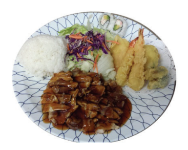
Chicken Teriyaki and Tempura