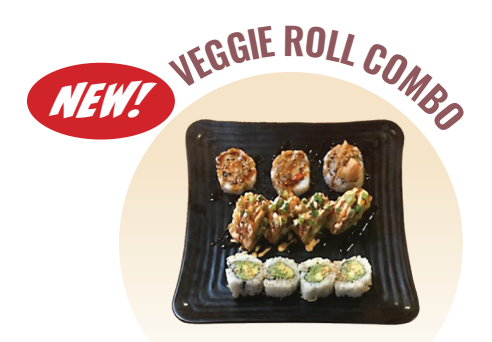
Veggie Tempura Roll (3pcs) Golden Munch Roll (4pcs) Avocado Cucumber Roll (4pcs) 12.95