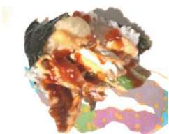
Cabo San Lucas Hand Roll Krab, Shrimp Tempura, Cream Cheese, Eel, Cooked Smoked Salmon, Avocado w/ Spicy Eel Sauce, Spicy Mayo, Sesame

We strongly advise that you check all the ingredients in the roll prior to ordering. Food may take longer to prepare during busy times.