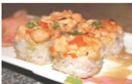
Baked Scallop Roll In: Krab, Avocado Top: Scallop, Masago w/ Creamy Sauce