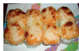
Pizza Roll 🌶️ In: Krab, Avocado Top: Spicy Mayo, Mozzarella Cheese

We strongly advise that you check all the ingredients in the roll prior to ordering. Food may take longer to prepare during busy times.