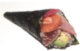
Mix Hand Roll Krab, Tuna, Shrimp, Albacore, Salmon, Avocado, Sesame