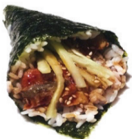
Eel & Cucumber Hand Roll Eel, Cucumber w/ Eel Sauce, Sesame