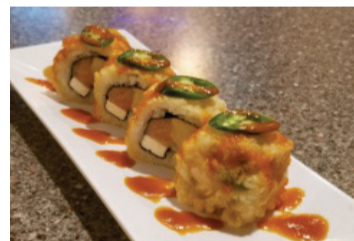
National City Roll 🌶️ In: Salmon, Cream Cheese, Avocado w/ Chili Sauce, Jalapeño, Sesame