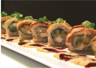
Golden Munch Roll (8 pcs) 🌶️ In: Sweet Potato Tempura, Zucchini Tempura, Cream Cheese w/ Spicy Mayo, Teriyaki Sauce, Green Onion, Sesame (Lightly Fried Tempura Style)