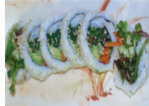
Veggie Roll (6 pcs) In: Green Seaweed, Avocado, Cucumber, Baby Radish, Burdock, Sesame