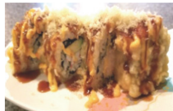
Bonita Roll 🌶️ In: Krab, Avocado w/ Spicy Mayo, Eel Sauce, Crunchy on top, Sesame