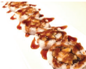
Vegetable Tempura Roll (6 pcs) In: Vegetable Tempura (Zucchini, Sweet Potato, Pumpkin) w/ Teriyaki Sauce, Sesame