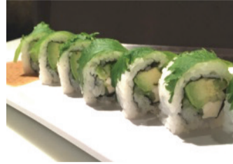
Bonsai Roll (8 pcs) In: Avocado, Cucumber, Tofu Top: Shiso (Japanese Basil) w/ Sesame Sauce