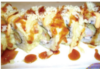
San Ysidro Roll 🌶️ In: Smoked Salmon, Cream Cheese, Avocado w/ Eel Sauce, Crunchy on top, Sesame, Spicy Mayo