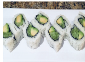
Avocado & Cucumber Roll (8 pcs) In: Avocado, Cucumber w/ Sesame