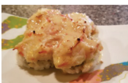
Baked Krab Roll In: Krab, Avocado Top: Krab w/ Creamy Sauce