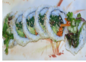
Veggie Roll (6pcs) In: Green Seaweed, Avocado, Cucumber, Baby Radish, Burdock, Sesame