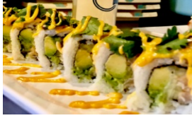
30th. St. Roll (8pcs) 🌶️ In: Spicy Albacore, Avocado w/ Spicy Mayo, Jalapeño