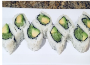
Avocado & Cucumber Roll (8pcs) In: Avocado, Cucumber w/ Sesame