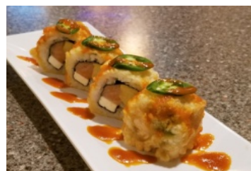
National City Roll 🌶️ In: Salmon, Cream Cheese, Avocado w/ Chili Sauce, Jalapeño, Sesame, Spicy Mayo