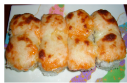
Pizza Roll 🌶️ In: Crab, Avocado Top: Spicy Mayo, Mozzarella Cheese

We strongly advise that you check all the ingredients in the roll prior to ordering. Food may take longer to prepare during busy times.