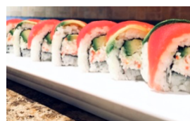
Sunset Roll (4 or 8pcs) In: Krab, Avocado Top: Tuna, Avocado