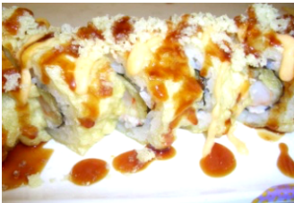
San Ysidro Roll 🌶️ In: Smoked Salmon, Cream Cheese, Avocado w/ Eel Sauce, Crunchy on top, Sesame, Spicy Mayo