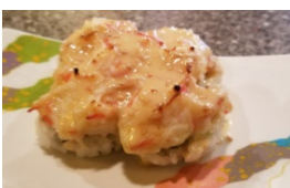
Baked Krab Roll In: Crab, Avocado Top: Krab w/ Creamy Sauce