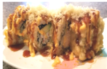
Bonita Roll 🌶️ In: Crab, Avocado w/ Spicy Mayo, Eel Sauce, Crunchy on top, Sesame