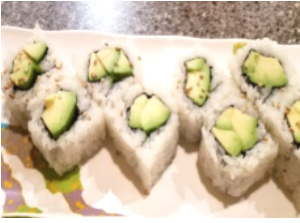
Avocado Roll (8pcs) In: Avocado w/ Sesame