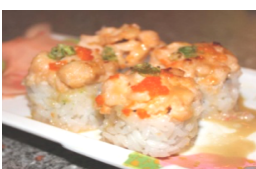
Baked Scallop Roll In: Crab, Avocado Top: Scallop, Masago w/ Creamy Sauce