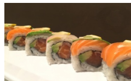
Tai-Dai Roll (8pcs) In: Salmon, Albacore Top: Red Snapper, Salmon, Avocado w/ Sliced Lemon, Ponzu Sauce