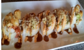
Calamari House Roll (6pcs) 🌶️ In: Fried Calamari, Spicy Tuna, Lettuce w/ Soy Beans Paper, Spicy Mayo, Eel Sauce, Crunchy on top, Sesame