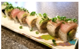
La Boheme Roll (8pcs) In: Spicy Yellowtail Top: Yellowtail, White Fish, Avocado, Green Onion w/ Garlic Sauce, Sesame