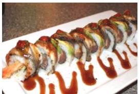
Fire Dragon Roll (8pcs) 🌶️ In: Spicy Tuna, Shrimp Tempura Top: Eel, Avocado, Spicy Eel Sauce, Chili Powder, Jalapeño, Sesame