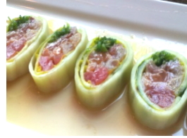
Protein Roll (No Rice, 6pcs) In: Tuna, Yellowtail, Salmon, Albacore, Green Seaweed. Out: Cucumber, Sesame, Soy Beans Paper w/ Ponzu Sauce.