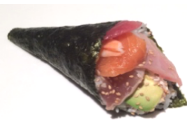
Mix Hand Roll Krab, Tuna, Shrimp, Albacore, Salmon, Avocado, Sesame