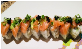
HANAOKA House Roll (8pcs) In: Krab, Albacore Top: Salmon, Avocado, Flying Fish Egg w/ Green Onion, Sesame, Ponzu Sauce