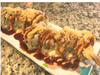
Chula Vista Roll 🌶️ In: Crab, Shrimp Tempura, Cream Cheese, Avocado w/ Eel Sauce, Crunchy on top, Sesame, Spicy Mayo