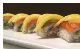
Tropical Mango Roll (8pcs) In: Krab, Avocado Top: Salmon, Avocado, Mango w/ Coconut Sauce

We strongly advise that you check all the ingredients in the roll prior to ordering. Food may take longer to prepare during busy times.