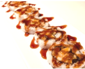
Vegetable Tempura Roll (6pcs) In: Vegetable Tempura (Zucchini, Sweet Potato, Pumpkin) w/ Teriyaki Sauce, Sesame