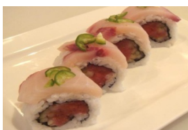
North Park Delight Roll (8pcs) 🌶️ In: Spicy Tuna, Avocado Top: Yellowtail, Jalapeño w/ Garlic Sauce, Sesame