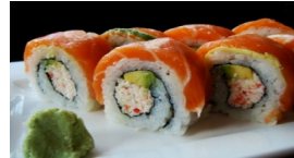
Sunrise Roll (4 or 8pcs) In: Krab, Avocado Top: Salmon, Avocado