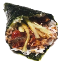
Eel & Cucumber Hand Roll Eel, Cucumber w/ Eel Sauce, Sesame