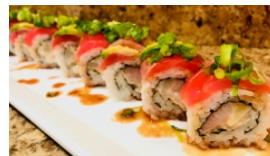
Ray at Night Roll (8pcs) In: Krab, Yellowtail. Top: Seared Tuna, Avocado w/ Green Onion, Sesame, Garlic Sauce