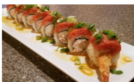
Hawaiian Roll (8pcs) 🌶️ In: Shrimp Tempura, Krab Top: Spicy Tuna, w/ Spicy Sauce, Green Onion, Spicy Mayo