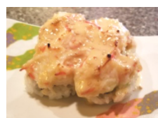
Baked Salmon Roll In: Crab, Avocado Top: Salmon, Masago w/ Creamy Sauce