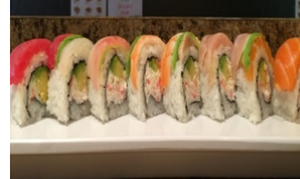
Rainbow Roll (4 or 8pcs) In: Krab, Avocado Top: Tuna, Avocado, Salmon, Albacore, Red Snapper, Shrimp